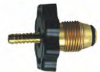
G-1656 (not excess flow)