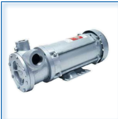
Corken C-Series Pumps