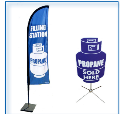
Propane Display Materials