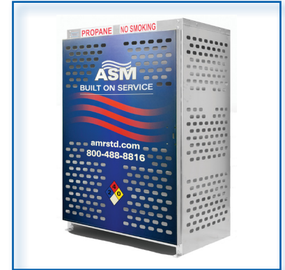
American Standard Cylinder Cabinets