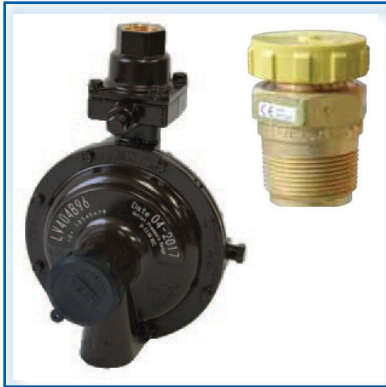
RegO Regulators & Valves

We're currently offering a limited selection of the items you use the most for convenient Will-Call pick up.