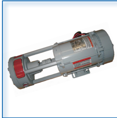
Smith E-Series Pumps