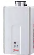
V Series Indoor Model

High Efficiency, Non-Condensing Technology. Ideal for medium to smaller homes, these compact models offer the perfect combination of comfort and value.