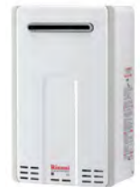
V Series Outdoor Model