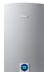
Bosch ProTL Series

Energy Star Rated - up to 98% efficient. Designed to offer maximum efficiency during high demand periods in the average North American home. Ultra Low NOx Certified. Digital display for accurate temperature setting. Intelligent cascading up to 24 units.