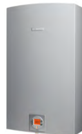
Bosch Condensing Electronic Ignition

Bosch Therm Condensing - C1210 Series - New model offers a flow rate of up to 12.1 gpm, 98% efficiency, and the most advanced features in tankless technology. It is designed to cascade for increased flow rates and will accommodate recirculating applications as well.