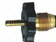
G-1656 (not excess flow)