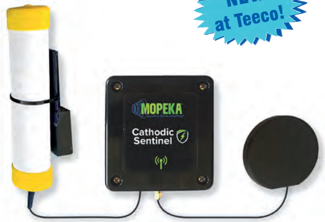
Cathodic Sentinel Item # M2015012

The Mopeka® Cathodic Sentinel solution is designed for both Pressurized and Non-pressurized underground tanks. Whether you are looking to protect and monitor your levels of Propane, Oil, Chemicals, or Water, Mopeka® has the solution to meet your needs.