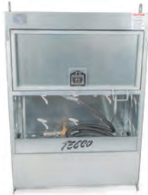
PACA PDM Dispenser

This lets our customers know that they are in top running order when they install them. Note – most jurisdictions require a Placed in Service Report before they are used for resale. This is usually accomplished by the County Weights and Measures. In some areas, this is performed by a local Prover Company.