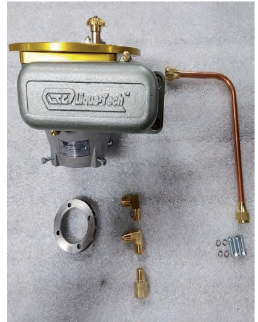
L101080-006 ATC Conversion Kit