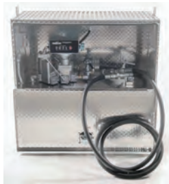
Teeco TDM Dispenser Diamond Plate Aluminum

We also offer Lifting Lugs (standard on all dispenser series); secure access doors for ease of repairs and maintenance; various hose offerings; Lower Security Doors (on PDM Series); Purging Systems and Automated Temperature Compensation (ATC) if needed.